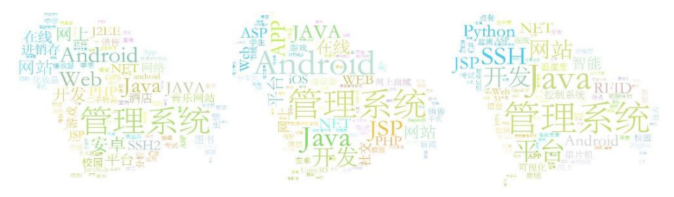
Figure 2. Analysis of 2015 topics

It is found from the above analysis that the mechanism of the graduation design check panel is established to effectively supervise and manage the computer graduation design process, as guided by the SE method, and based on the CDIO concept. Due to the constraints or pressure of the mechanism, the graduation design instructors or students will continue to innovate to inspire the students' potentials and allow them to appreciate the essence of the SE method in the graduation design process, have a good command of the hotspot technology and methods in the computer field, thus achieving a smooth transition to the employment in the later stage. The application of this method has realized the practical education in universities, and further enhances students' practical competence through continuous learning and improve the quality of graduation design. With this method, it is also possible to provide specialized guidance for future practical teaching and make clear the direction of professional education.