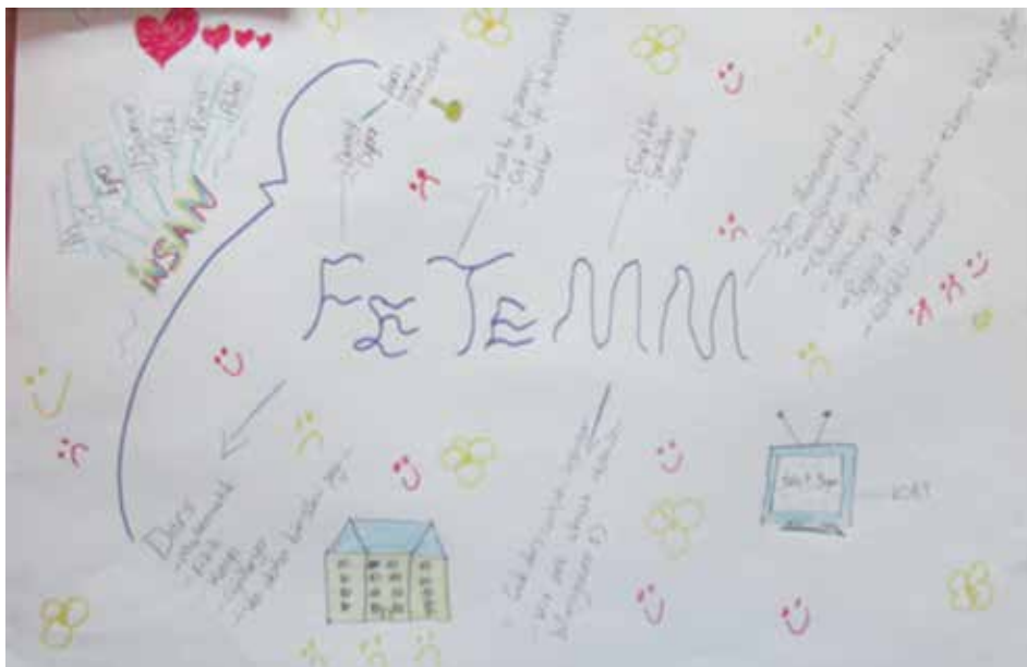
Figure 1. A sample of mind map.

and puzzle codes were also mentioned. Under the engineering theme, the major codes of construction (22), drawing-architecture (16), machinery (14), industry (9) were mentioned. Under the theme of environment, the codes of nature (19), pollution (12), recycling (5), global warming (5) were mentioned. Laboratory-experiment (26) was the most frequently mentioned code under the theme science. The codes of scientific method (11), scientist (11), and progress (10) were also mentioned. Figure 1 reproduces a sample of the mind maps drawn by the pre-service teachers.