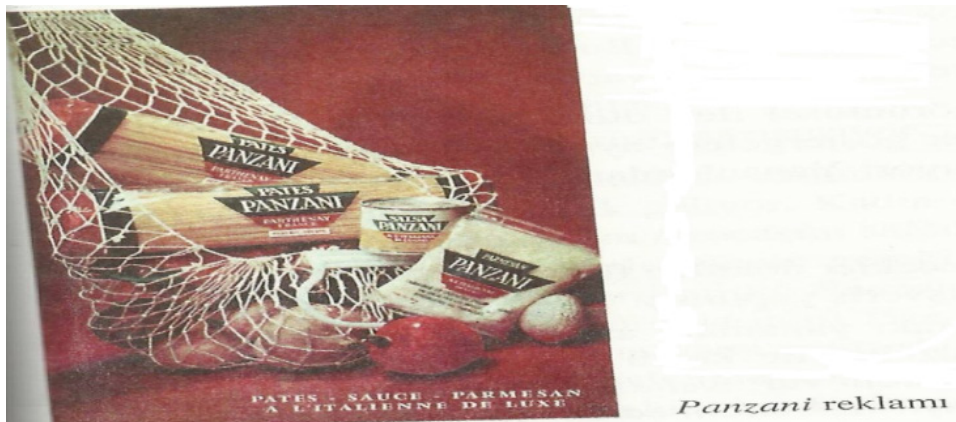
Figure 2. Advertisement of Panzani.

For Barthes, as is seen in the following photograph, the message of the advertisement is composed of three layers: linguistic message, unencrypted visual message, and encrypted visual message. The first message is composed of the labels and the script. The second layer, the unencrypted visual message, is composed of familiar things such as spaghetti packs, nets, tomatoes, etc. These two layers are in the sphere of literal meaning. However, the essential sphere that truly makes the advertisement is the layer of connotative meaning. Here Barthes distinguishes the signs and interprets the same with regard to cultural background (Akerson, 2005).