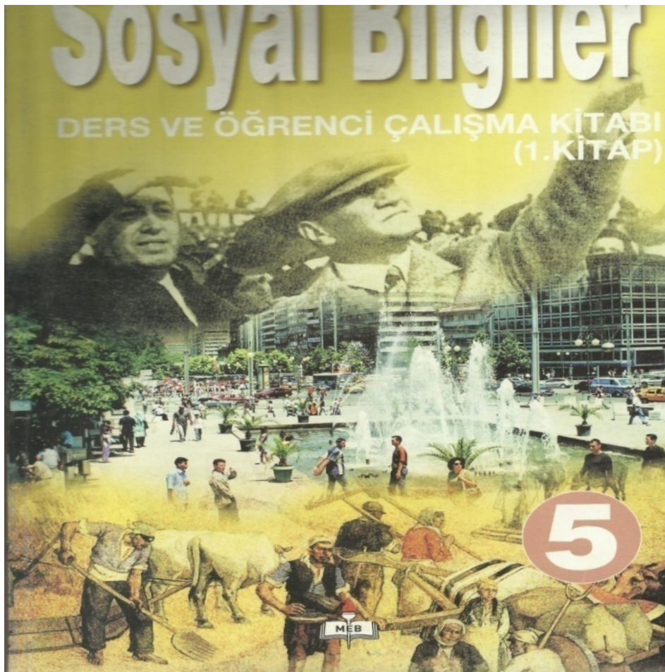
Figure 3. The cover photograph of the Social Sciences text book (Başol et al., 2011).

For the purpose herein, the following cover photograph from the Social Sciences textbook that was adopted by the MNE for use by 5 th graders in primary schools under the MNE during the 2011-2012 school year was taken into consideration.