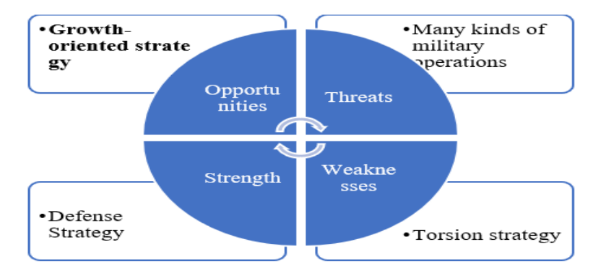
Figure 2. Analyze the method model diagram of SWOT.

Based on the above analysis and guided by SWOT theory, the paper takes English teaching as object of the research to examine development advantages and disadvantages, extract opportunities and challenges, and use matrix analysis method to select method most conducive to English MOOC teaching. It is of great significance for opening up the MOOC teaching market.