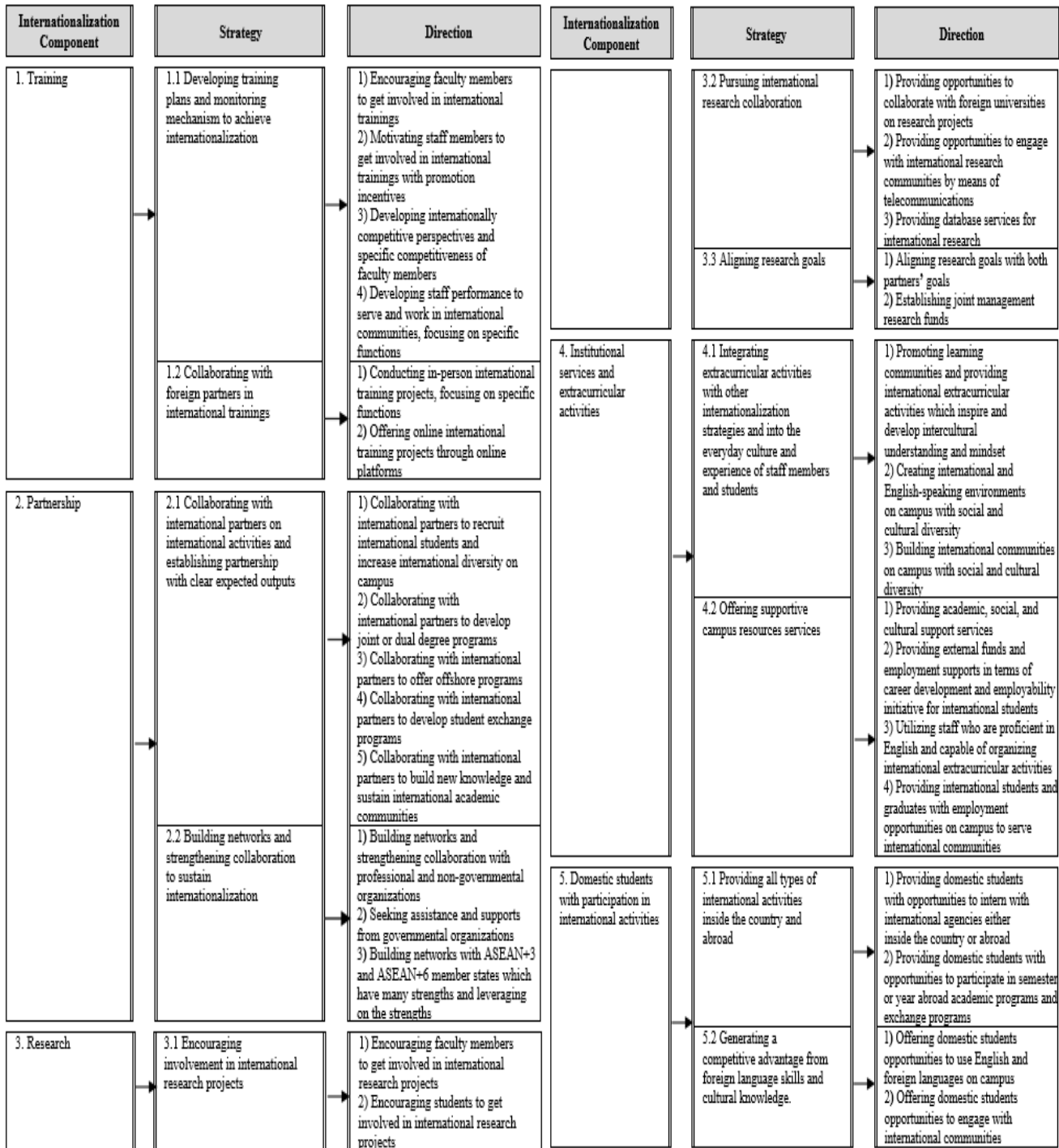
Figure 2: The Strategies and Directions for Enhancing Internationalization of Graduate Programs in Public Universities in Thailand

The stakeholder-oriented model was established to address the needs of each major stakeholder to increase the internationalization of graduate programs in Thailand's public universities. The participation of faculty members facilitates the incorporation of internationalization efforts into the institutional operations of higher education. In addition to being obliged to participate in teaching development, faculty members are encouraged to perform research. Students at the graduate level are also required to produce work and contribute through research. Participation in research by students generates new knowledge, whereas participation in international and extracurricular activities generates experiences, skills, and attitudes.